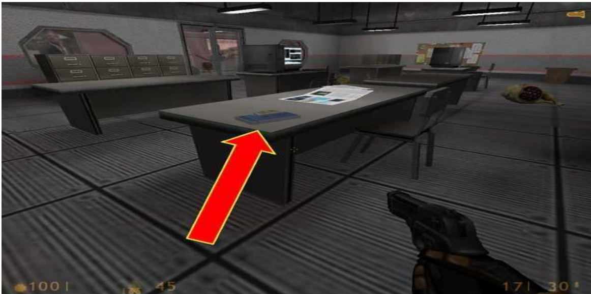
PIC #5 – This lightblue thing is the required security card for the control room