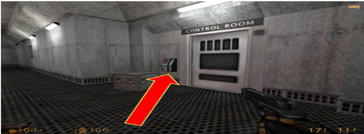
PIC #7 – The elevator control room, use the security card at the card reader (just „use“ it)