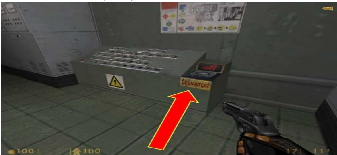
PIC #8 – Hit this switch to turn on the elevator (rather to open a door to gain access to it)