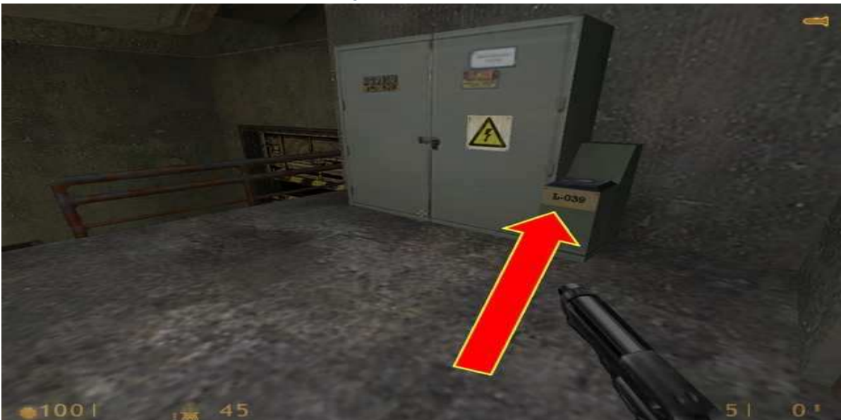
PIC #2 – Upstairs, hit the switch named „L-039“