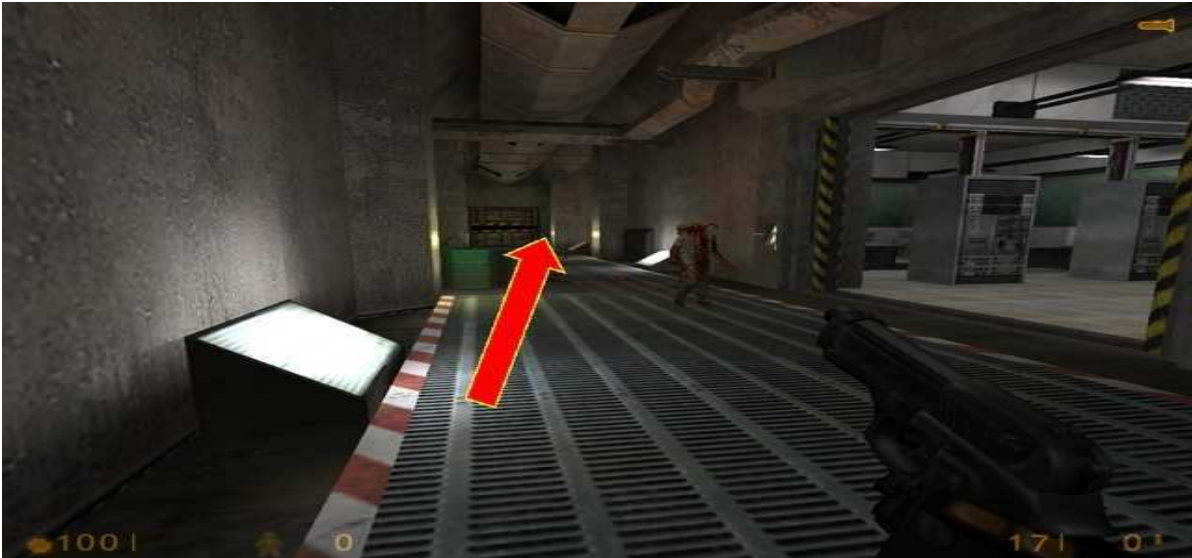
PIC #1 – Go to the end of the hallway, climb up the ladder