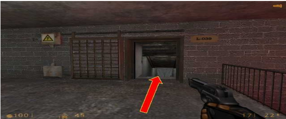
PIC #3 – Through here (if door „L-039“ is still closed see PIC #2 again)